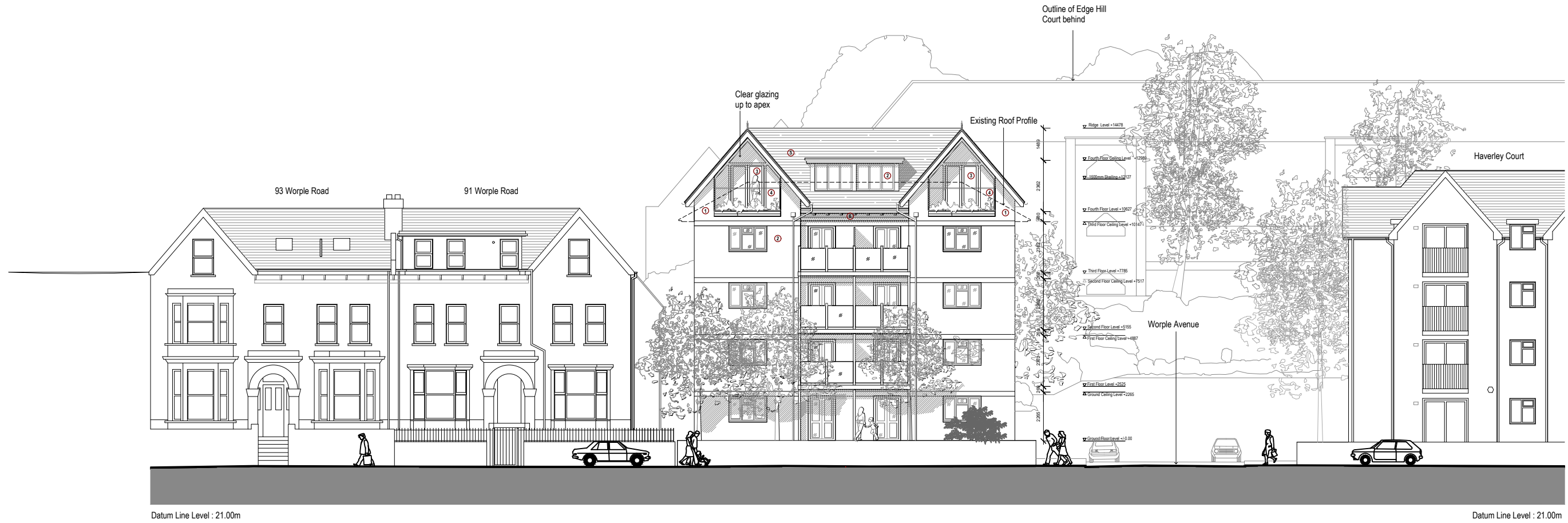
Front Elevation (from Worple Road)